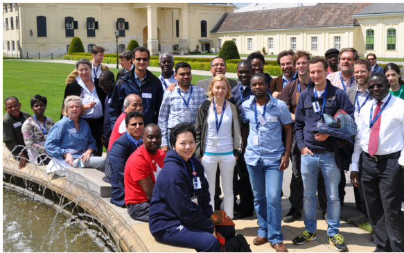
CLASS OF 2012 - 2014

For MACS 2012 – 2014, IACA offered five full scholarships to participants from Least Developed