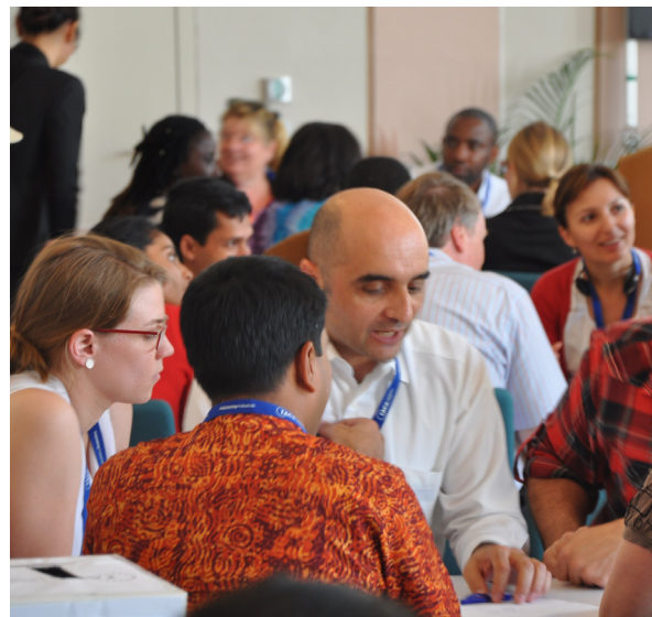
SUMMER ACADEMY 2014

The fifth annual Summer Academy offers an interdisciplinary curriculum for professionals looking to consolidate their experience and enlarge their competences to better counter corruption. It is scheduled from 2 to 11 July . The application deadline ends on 31 March.